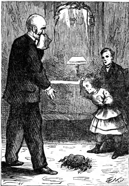
THE MAJOR'S JOKE. Page 78.